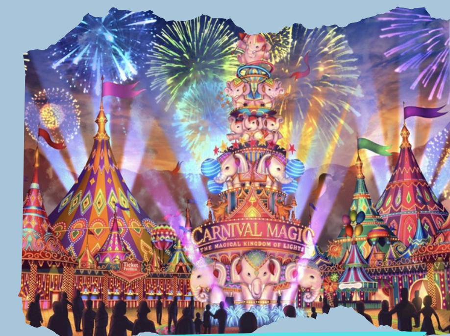
PHUKET FANTASEA / CARNIVAL MAGIC