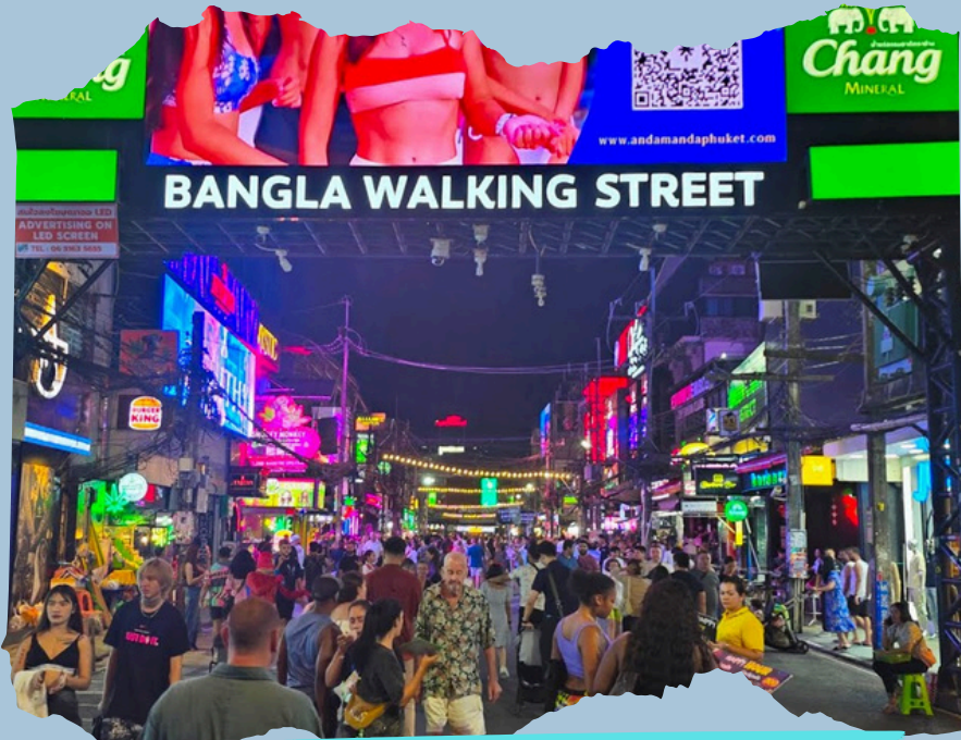
BANGLA ROAD NIGHTLIFE