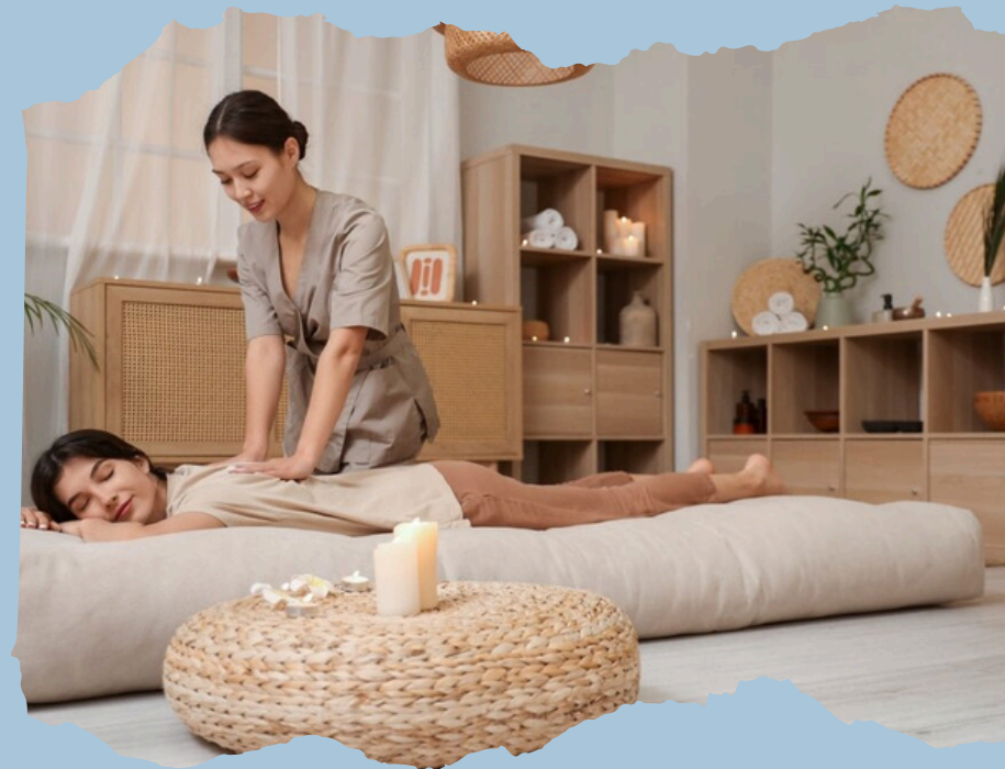
THAI MASSAGE & SPAS