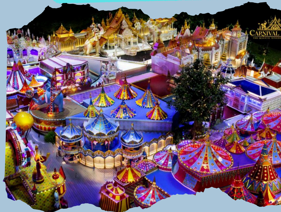
PHUKET FANTASEA / CARNIVAL MAGIC