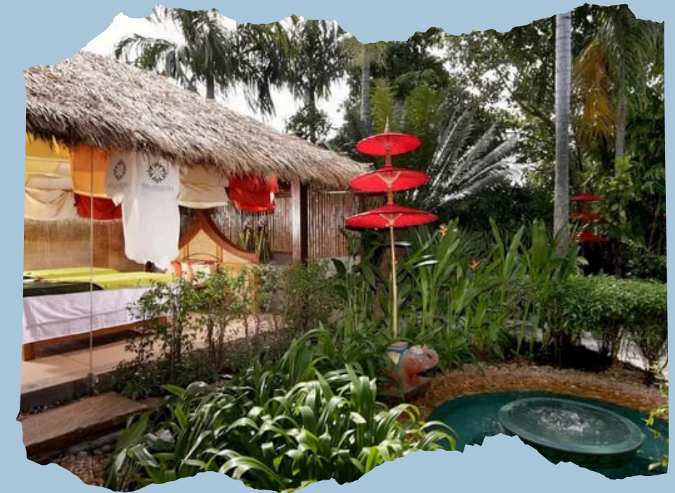
THAI MASSAGE & SPAS