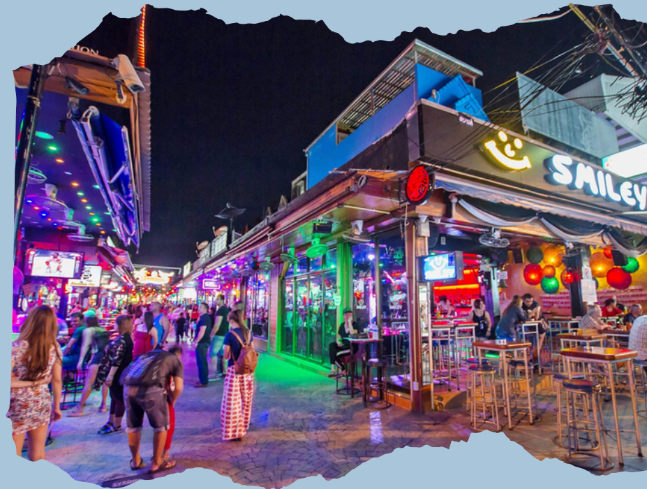
BANGLA ROAD NIGHTLIFE